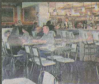
UPTOWN MARKET & DELI

Third and Main is also home to the newly opened Uptown Market & Deli and The City Kidz Ice Cream Café. They are among several new local restaurants in the Springfield neighborhood. Others include Fusion Art Wine Jazz, Hola Mexican Restaurant, The Cellar, Wafaa & Mike's Mediterranean, and Three Layers Coffee House, which has been named "Best Coffee Shop in Jacksonville" by Folio Weekly.