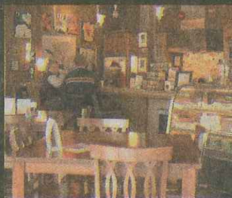
THREE LAYERS COFFEEHOUSE