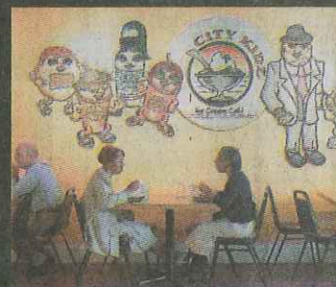
CITY KIDS ICE CREAM CAFE