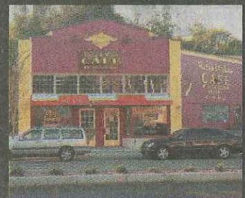
WAFAA & MIKE'S CAFE