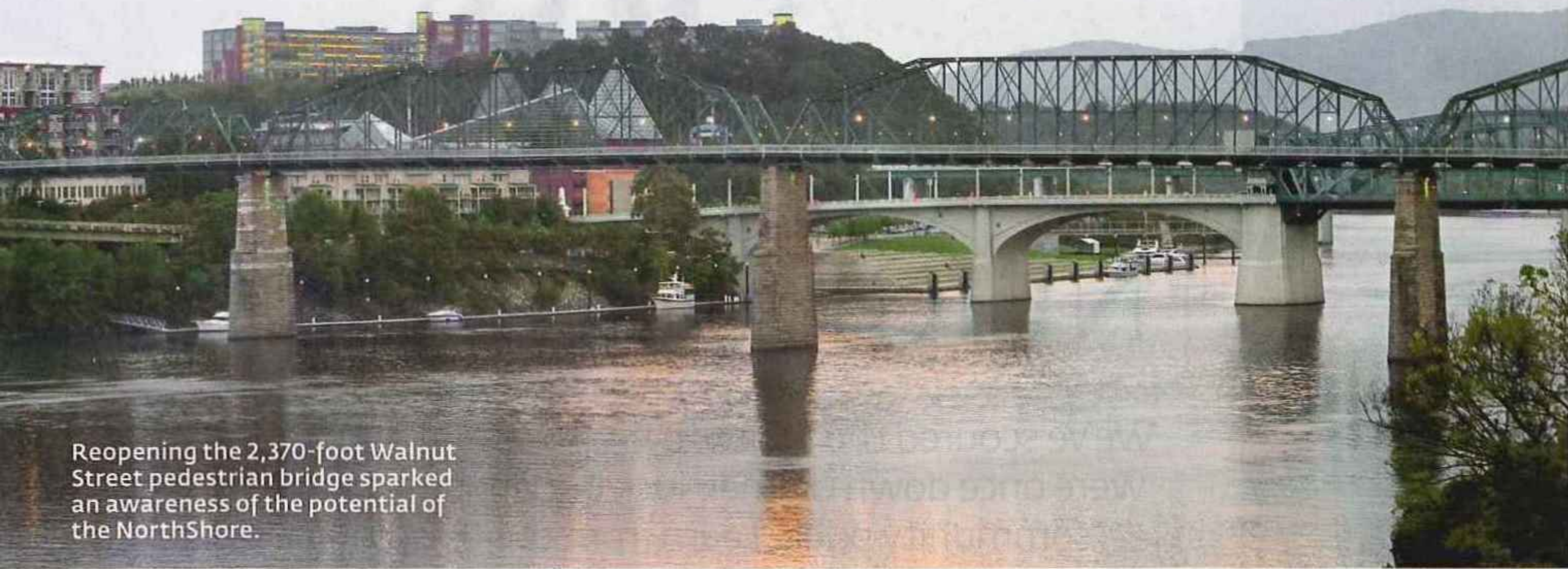
Reopening the 2,370-foot Walnut Street pedestrian bridge sparked an awareness of the potential of the NorthShore.