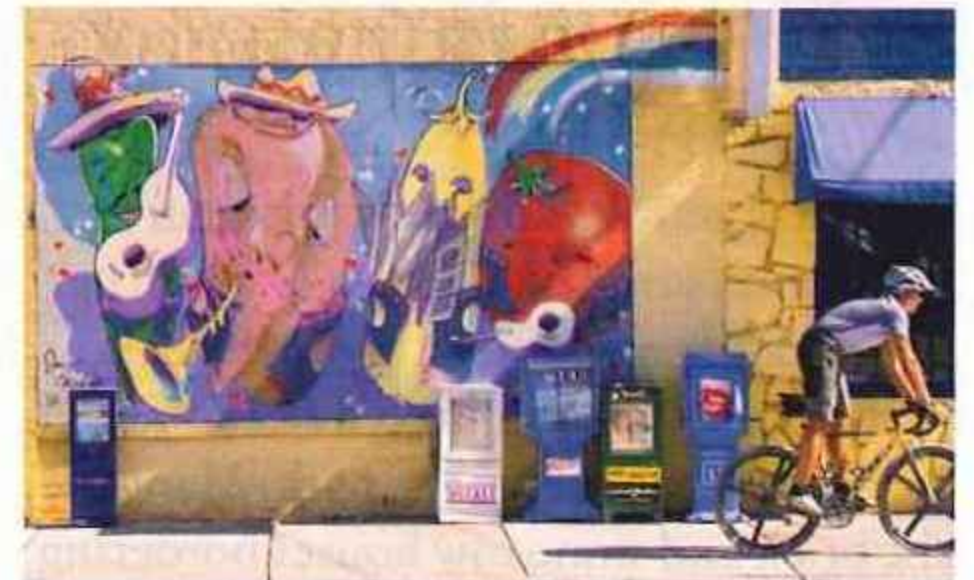
New housing fits the historic mix of South End neighborhoods.