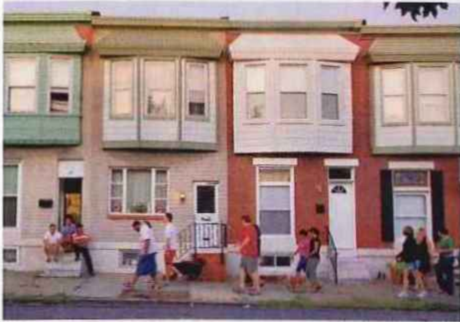
Patterson Park is a neighborhood of row houses and front stoops.